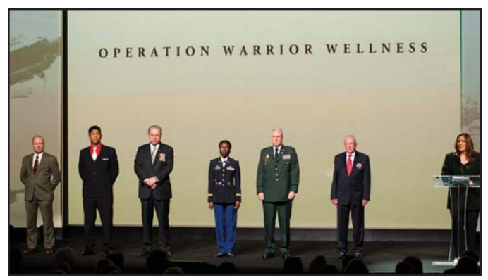
Operation Warrior Wellness was launched in 2011.