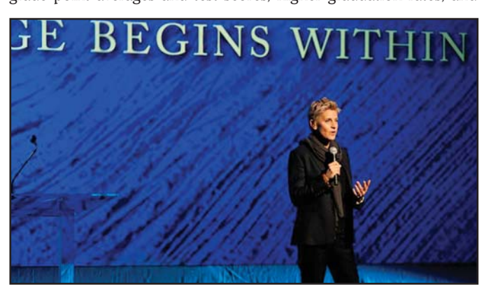
TV talk show host Ellen DeGeneres welcomes the crowd with some major laughs at DLF'S "Change Begins Within III" at the Los Angeles County Museum of Art in December 2011.

In 2011, the filmmaker behind the movies "Blue Velvet" and "Mulholland Drive" organized for his foundation to donate $1 million to launch Operations Warrior Wellness in Los Angeles, an initiative to help 10,000 veterans overcome post-traumatic stress disorder (PTSD) and other war-related illnesses through